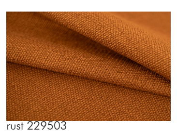
PALEA RIGATO 50% linen, 35% co, 15% vi, width 140 cm - use heavy use upholstery sample available: memo sample, road kit, small hanger, hanger, wing, mini book